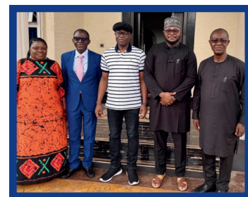
A cross section of the team with the Chief Judge of Edo State